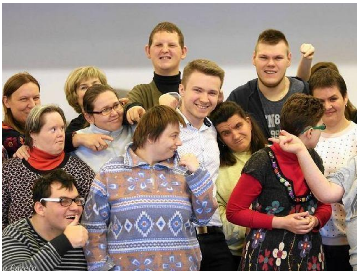
Founder of our fondation together with our pupils